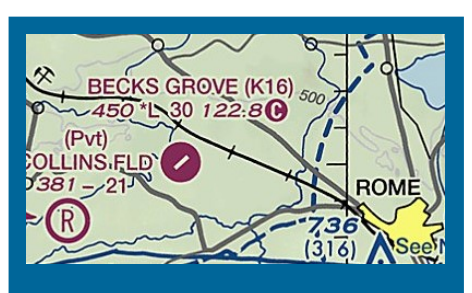
Destination: Becks Grove (K16), Rome, NY