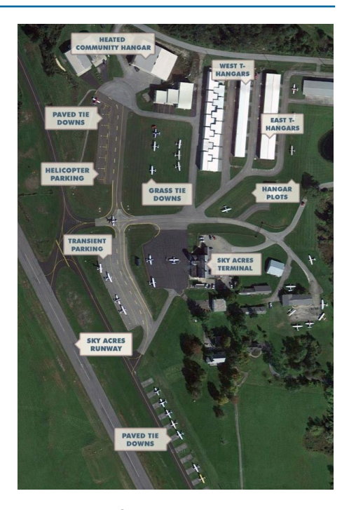
edge of the main ramp.